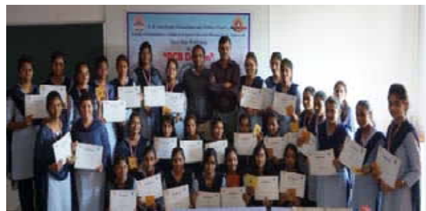
Student participants during the workshop.