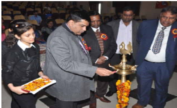
Dignitaries during the inauguration of the programme.