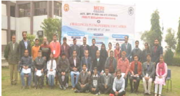
Dignitaries, participants, faculty and students during the programme.