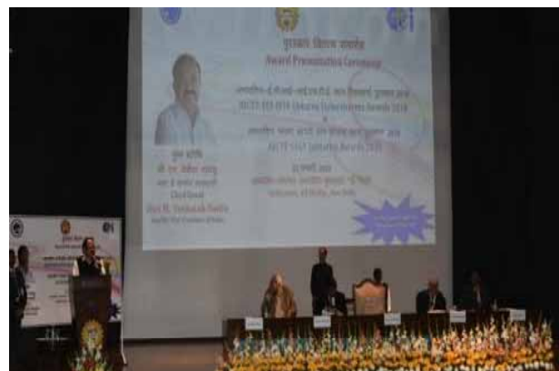
Inauguration of 2nd AICTE-ECI-ISTE Chhatra Vishwakarma Awards on January 21, 2019 by Hon'ble Vice President of India Shri M. Venkaiah Naidu Ji at AICTE Hqrs., New Delhi