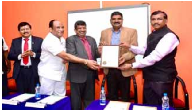
Dignitaries on the dais during the inauguration of ISTE Student Chapter.