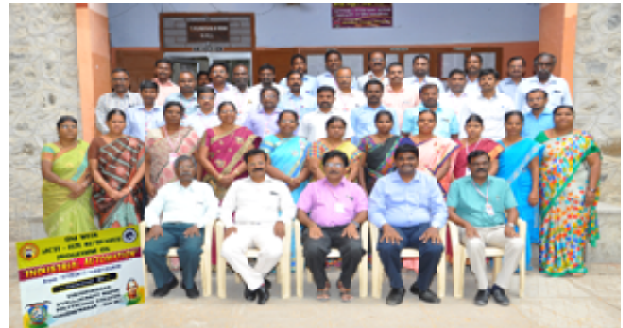
Participants, Faculty and Resource persons during the programme.