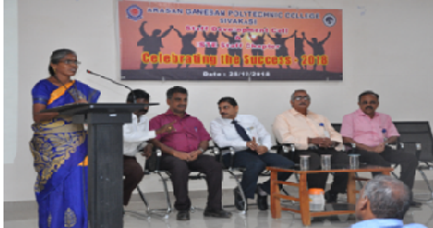
Dignitaries on the dais during the inauguration of the programme