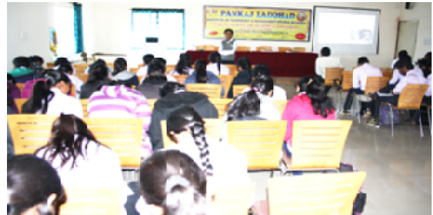
Student participants and faculty members during the program.