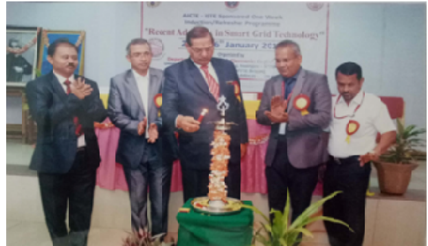
Dignitaries during the inauguration of the programme.