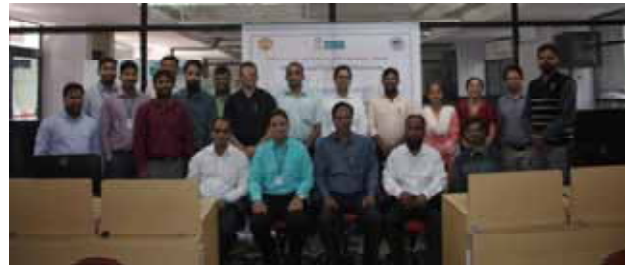
Participants alongwith invited speakers during the session.