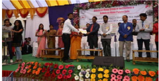
Prize distribution to winner student participants.