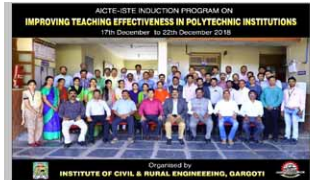
Dignitaries, participants, faculty and students during the programme.