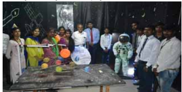
Science Exhibition at a glance.