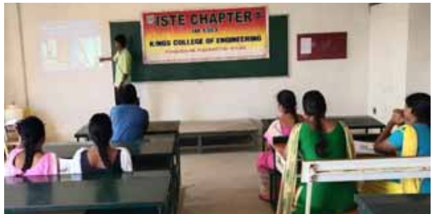
Student actively presenting the papers during the paper presentation.