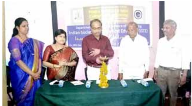
Dignitaries on the dais during the inauguration of ISTE Student Chapter.