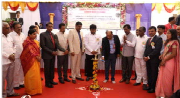
Dignitaries during the inauguration of the 16th ISTE Students Convention of ISTE Maharashtra & Goa Section.