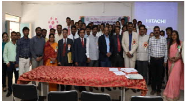
Participants, faculty and dignitaries during the convention.