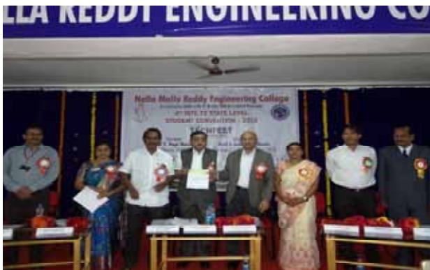
The Secretary, NMREC presenting rupees two lakh cheque to the Chairman ISTE TS Section.