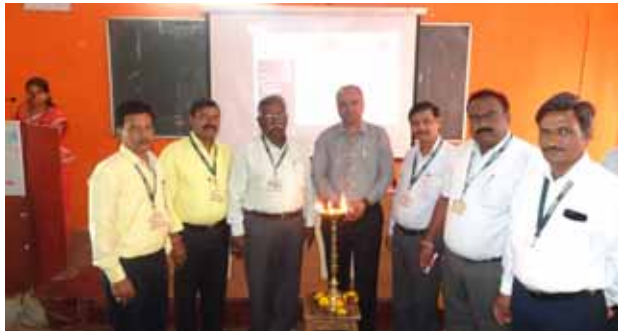
Dignitaries on the dais during the inauguration of the programme