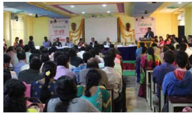
Dignitaries on the dais during the inauguration of ISTE TS Convention and Award Function.